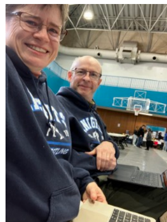
Above: Working at the wrestling tournament in the first hour while everyone was warming up.