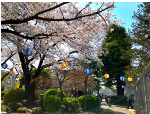
Photos: (from top, clockwise) Cherry blossoms in a nearby park, Wendy's birthday, baking ANZAC biscuits, our balcony with washing and plants, CAJ in all its glory during the 75th celebrations.