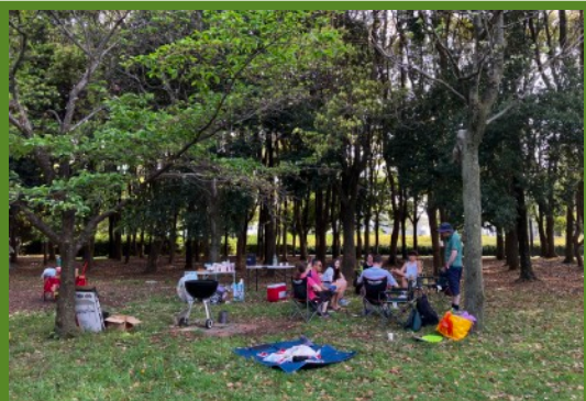
We celebrated a friend's 50th birthday party on a rare April day: perfect weather. Three families, four nationalities, but one Lord. It was a wonderful day.

The number on internationals in Japan is rapidly rising. In 2023 almost 1.3 million more foreigners lived in Japan than in 2013. Some come from nations that have a strong Christian population, others don't. It's exciting times in Japan. Let's pray for God to work in Japanese returnees, as well as the nearly four million internationals who now live in Japan.