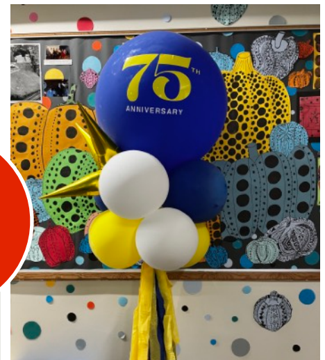
April began with the 75th anniversary celebrations of CAJ.