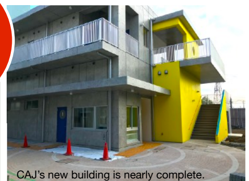
CAJ's new building is nearly complete.